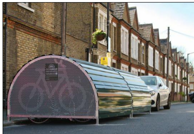
Example of bikehanger cycle shelter